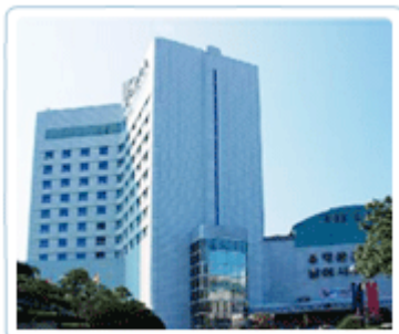
Hotel Riviera Yuseong

Hotel Riviera Yuseong is located in the center of transportation and culture of Korea. As a five-star hotel for leisure and business, we are famous for the high level of customer satisfaction. Hotel Riviera Yuseong is the preferred hotel for international guests due to reputation as the headquarter hotel of many international events like 2002 Korea/Japan World Cup, 1993 World Expo Daejeon, 1988